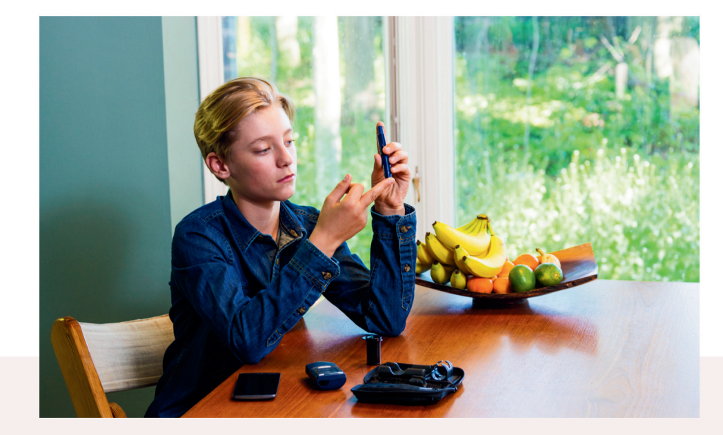
Type 2 Diabetes

Type 2 Diabetes is an impairment in the way the body regulates and uses sugar as a fuel; even though insulin is produced naturally, the body's cells have stopped responding well to it.